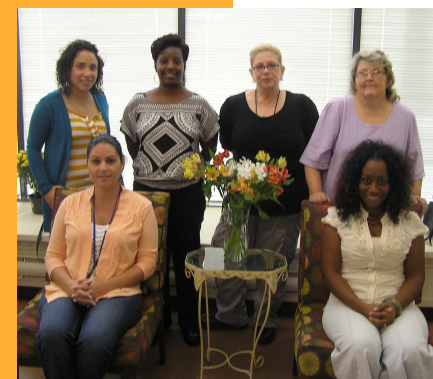
Staff Members of the LCS Women's Group Committee

This year Liberty Community Services is very excited to announce the start of our first agency wide, Women's Group. The Women's Group opened on September 26, 2011 with a warm celebration. The group is regularly held Monday through Thursday from 9-11 next to our Safe Haven building. This group is open to any woman that is receiving services from LCS. Groups include topics ranging from stress management to knitting and sewing. Outside speakers from the community will also offer groups to participants. A creative writing group and a women's empowerment group are on the cur-