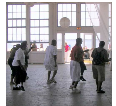
LCS staff and clients dance the electric slide

On Wednesday, June 29 th , Liberty hosted its first annual cookout for clients at Lighthouse Point Park in New Haven. Hamburgers and hotdogs were provided by Sweet Relief Catering, Popeyes donated several trays of fried chicken, and a Liberty staff member's mother provided some delicious side dishes as well. The event was held within the carousel house and everyone enjoyed the beautiful weather outside. A number of clients remarked that they really enjoyed their time at the cookout and couldn't wait for Liberty to have another one next year!