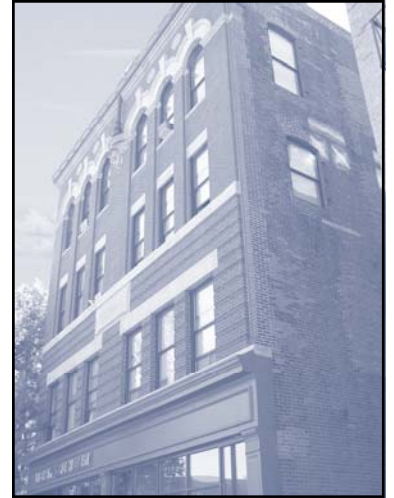
Liberty Safe Haven, the site of Liberty's new Day Program.