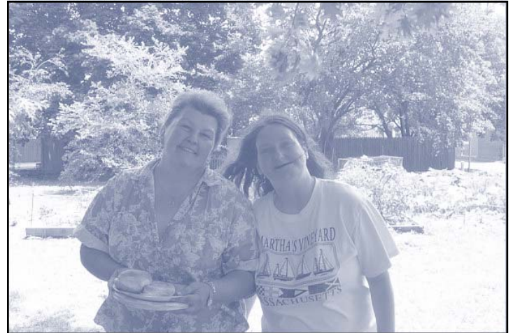
A summer 's day at Liberty's community garden.

The garden season ended on a high note with a