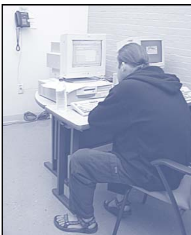
Computers and computer classes are available to participants of Liberty's Day Program (story on page 5)